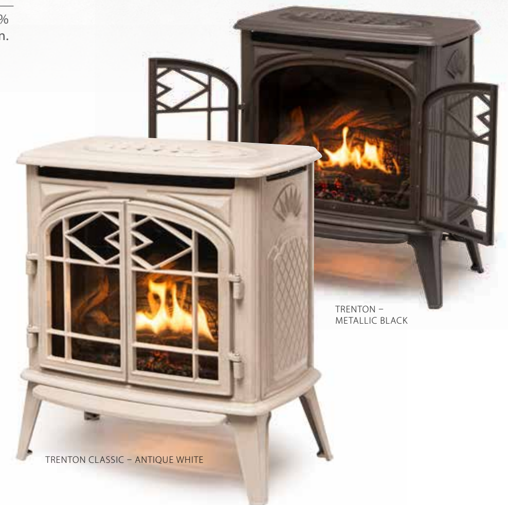
TRENTON – METALLIC BLACK

Available in three finishes: Metallic Black Cast Iron (Trenton) Majolica Porcelain Enamel, and Antique White Porcelain Enamel (Trenton Classic)