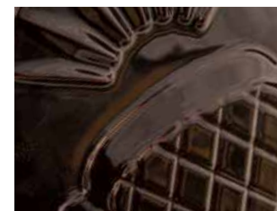
Majolica Porcelain over Cast Iron