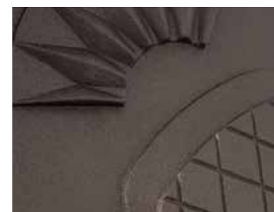
Metallic Black Cast Iron