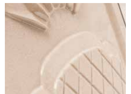
Antique White Porcelain over Cast Iron