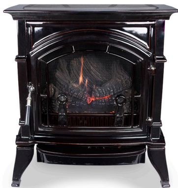
CSVF Series Vent Free Gas Stove