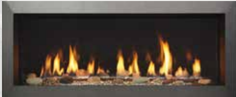
Picture Frame Front (available in Charcoal and Pewter for the 36", 48", and 60")