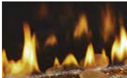
Reflective Black Glass Panels