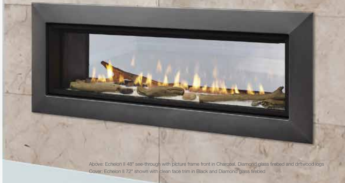
Above: Echelon II 48" see-through with picture frame front in Charcoal, Diamond glass firebed and driftwood logs Cover: Echelon II 72" shown with clean face trim in Black and Diamond glass firebed