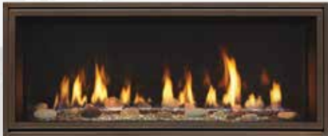
Clean Face Trim (available in Black, Bronze and Pewter)