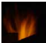
Reflective Black Glass (single-sided only)