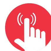
PUSH-BUTTON/ FLAME SENSING