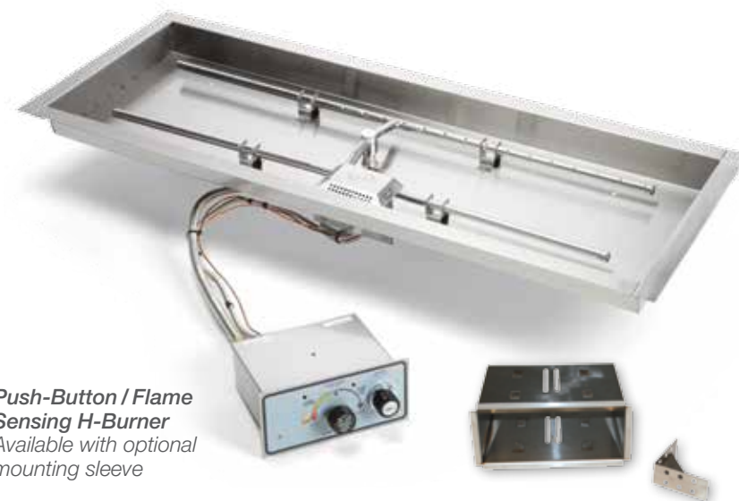
Push-Button / Flame Sensing H-Burner Available with optional mounting sleeve