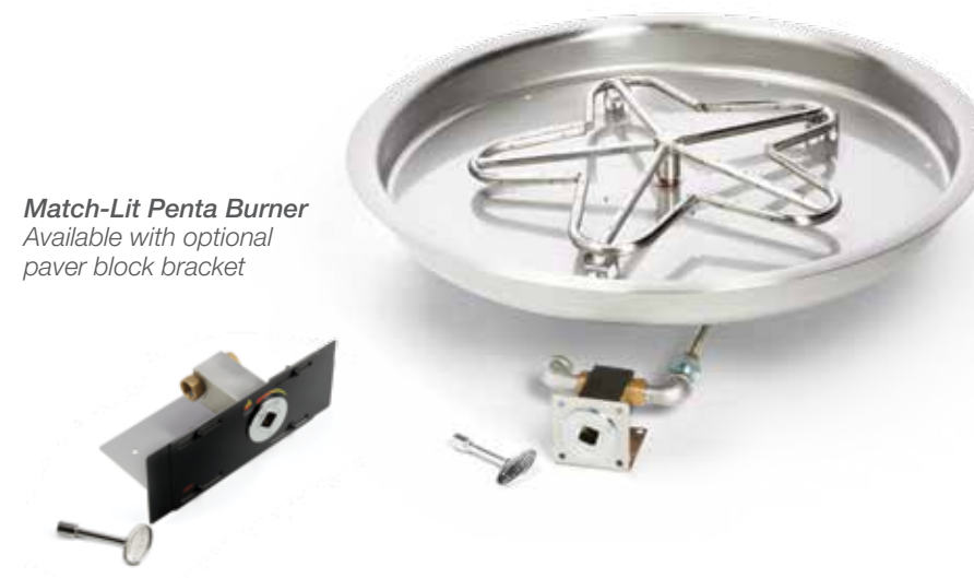
Match-Lit Penta Burner Available with optional paver block bracket